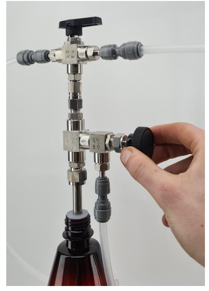
Step 8. After the bottle has been purged of any oxygen, close the bleed valve and pressurise the bottle back up to 10psi with CO<sub>2</sub>.

Step 9. Turn the handle in the direction of the beer inlet to begin the flow of beer. Beer will begin flowing into the bottle. If the transfer of liquid into the bottle slows to a halt slowly open the gas bleed valve to allow some gas to escape. This will allow liquid to begin flowing into the bottle again.