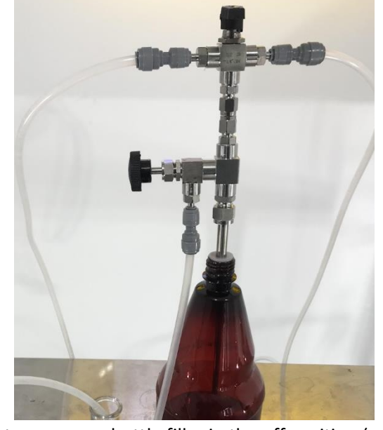
Step 5. Start with the handle of the counter pressure bottle filler in the off position (perpendicular to the unit).

securely into the opening of the bottle.