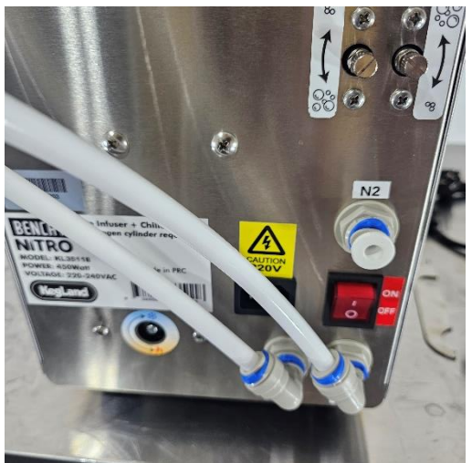
Page 4 of 9